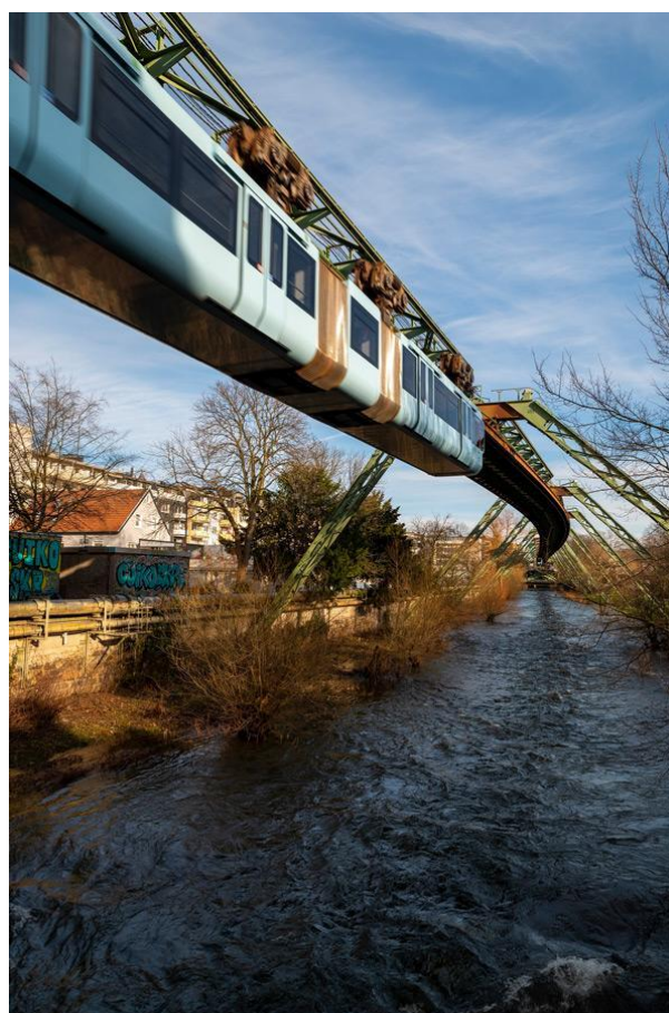
Figure 5. Wuppertal, Germany's overhead monorail, extant for many decades, offers modern slung rail passenger service with on-board human drivers. Were this a photograph of the Los Angeles River, much plastic macro-litter would be visible to overlooking train commuters.