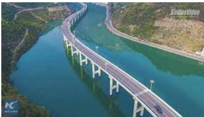
Figure 4. China's Hubei Province by 2015 built a 10.5 km-long road at the mid-line of its Xiangxi River to connect the town of Gufuzhen in Xingshan County to the main highway linking Shanghai to Chengdu in southwestern China. A similar highway over the Los Angeles River must be approved by the US Army Corps of Engineers and some other agencies as well.