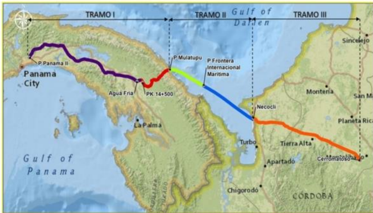
Figure 2. Panama and Colombia electrical grids linked across Gulf of Darién by underwater power-cable.