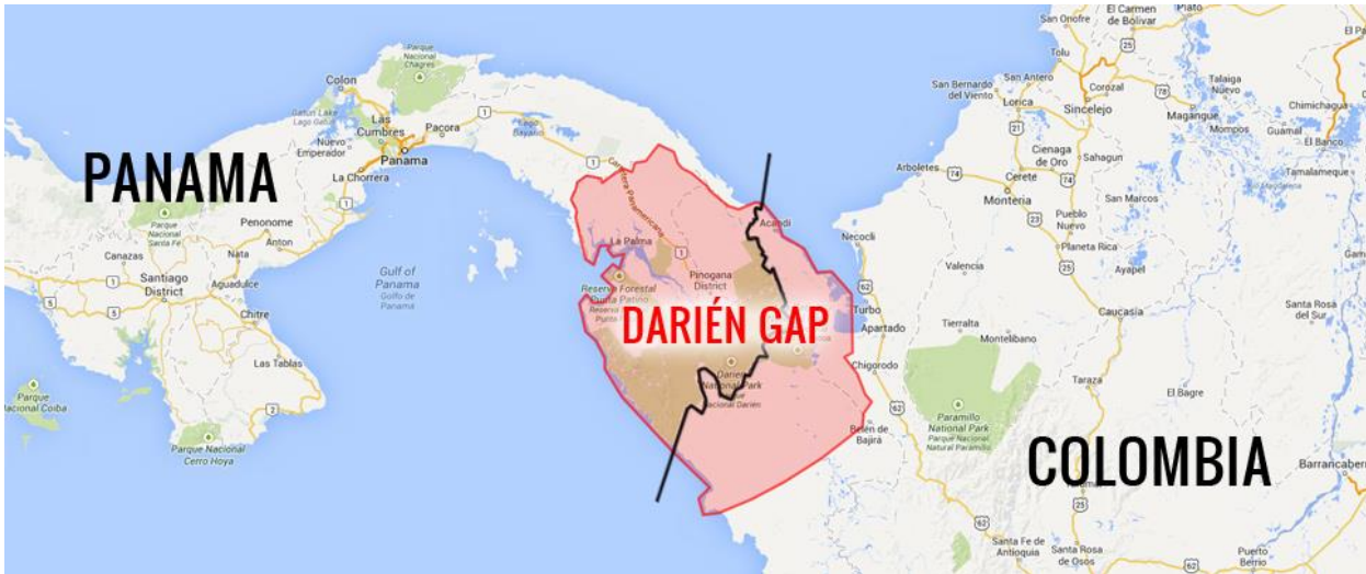
Figure 1. The Darién Gap’s mature rainforest and swamps intervenes between Panama and Colombia.