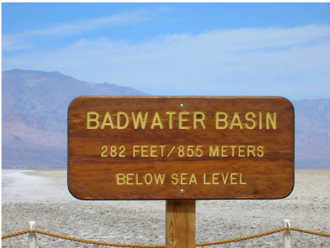
Figure 1. The Badwater Basin occupies the lowest point in California. Other sites that are below sea level include parts of the Imperial Valley (exemplified by the Salton Sea) as well as the Sacramento River-San Joaquin River combined delta which empties its flow-through polluted freshwater into San Francisco Bay.

In the New World, two places with the lowest elevation are Laguna de Carbon, Argentina (minus 105 m, 49° 35' S by 68° 20' W) and the eponymous "Badwater" salt-flat in Death Valley (minus 85.5 m at 36° 51' N by 117° 17' W). Figure 1. The 883 km 2 part of Death Valley that is currently below sea-level could hold ~44 km 3 of precipitated brine salt [11].