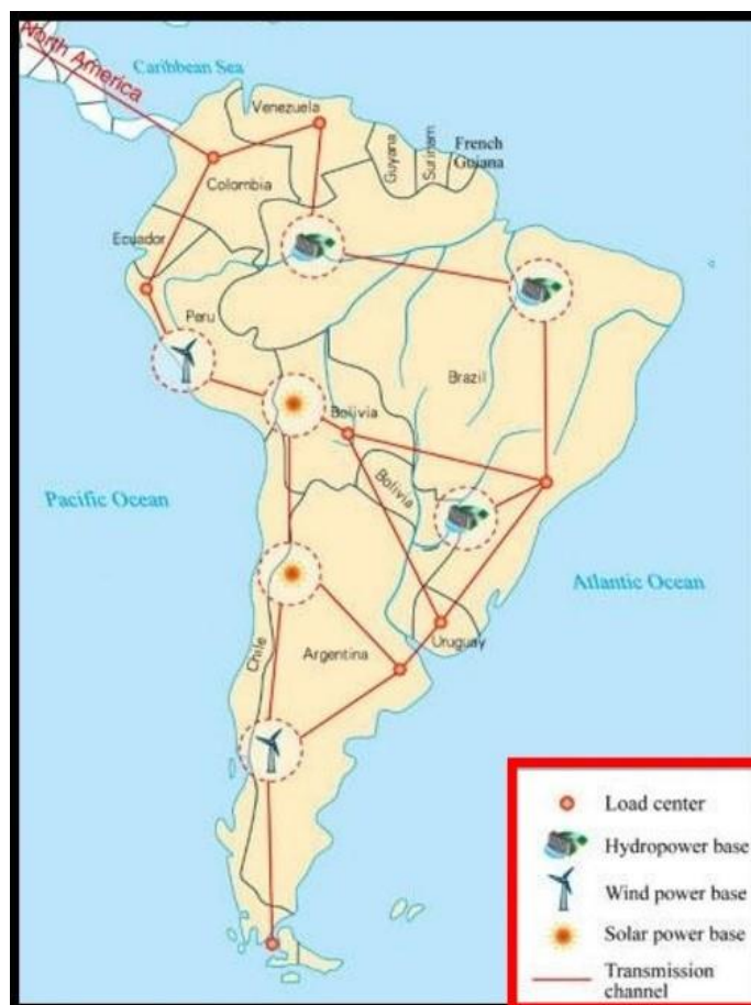
Figure 2. The cooperatively managed electricity grid of South and Central America as it might appear by mid-21st Century. (Google image.)

electrical grid connections between Columbia and Panama. Unfortunately, post-2020 AD unmanaged migration has somewhat despoiled sections of the Darien Gap's landscape.